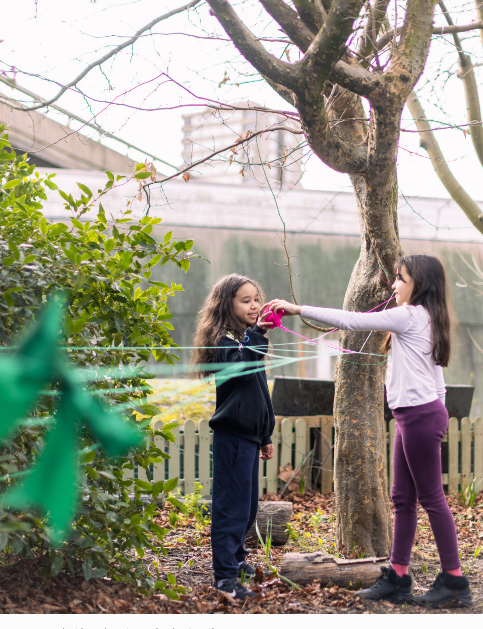
Flourish, North Kensington.