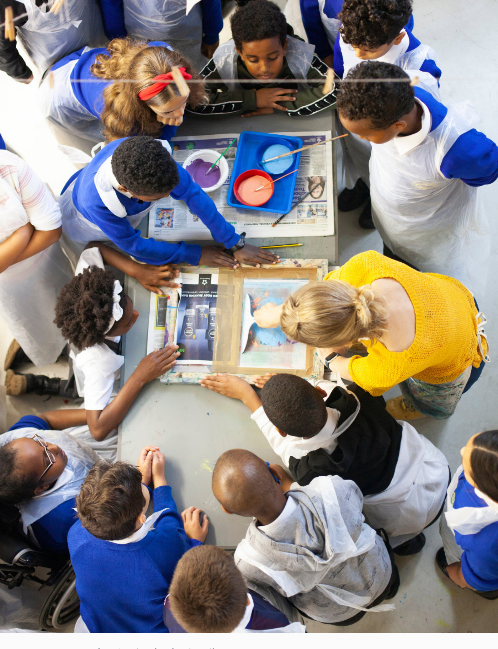
Young London Print Prize.