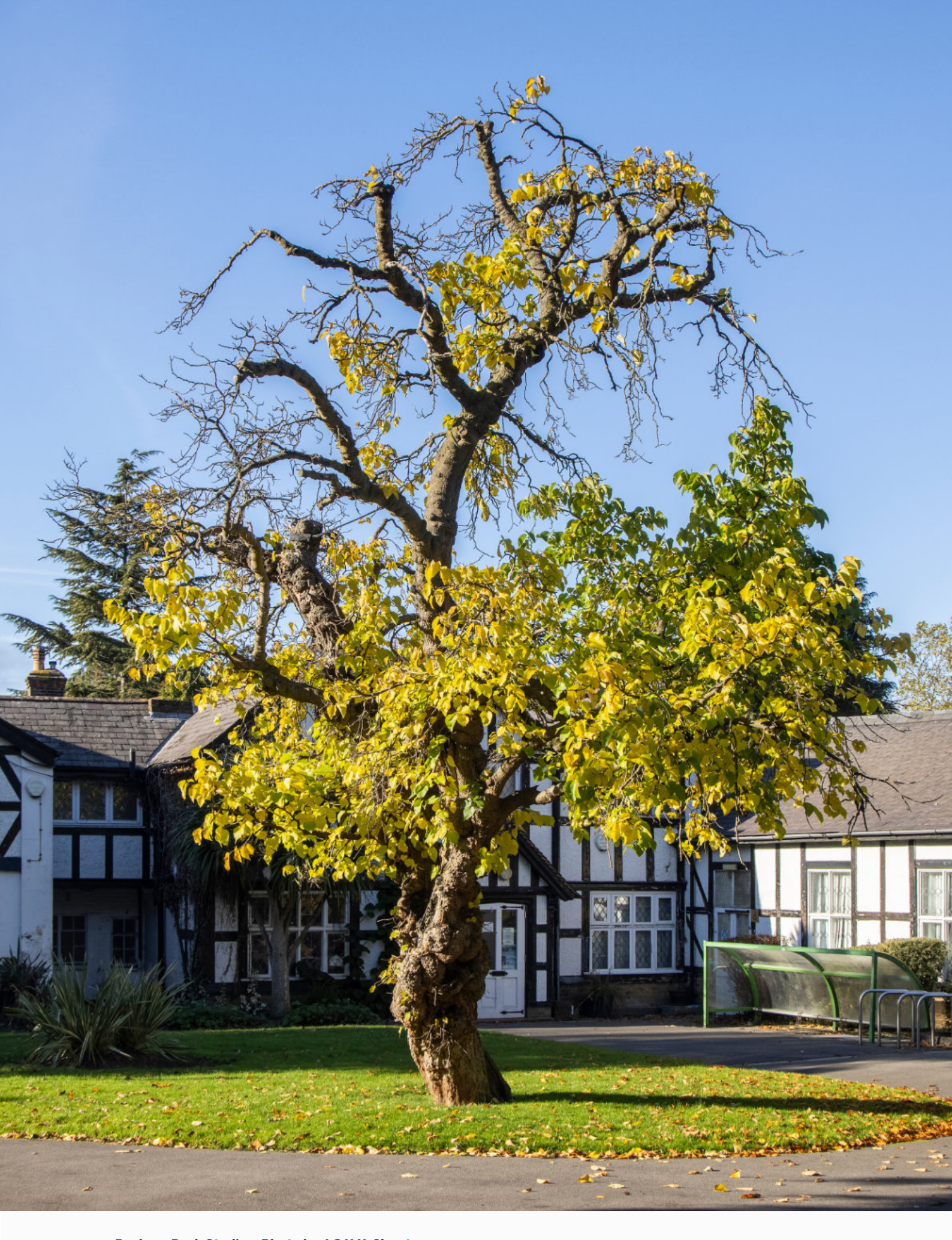
Barham Park Studios.