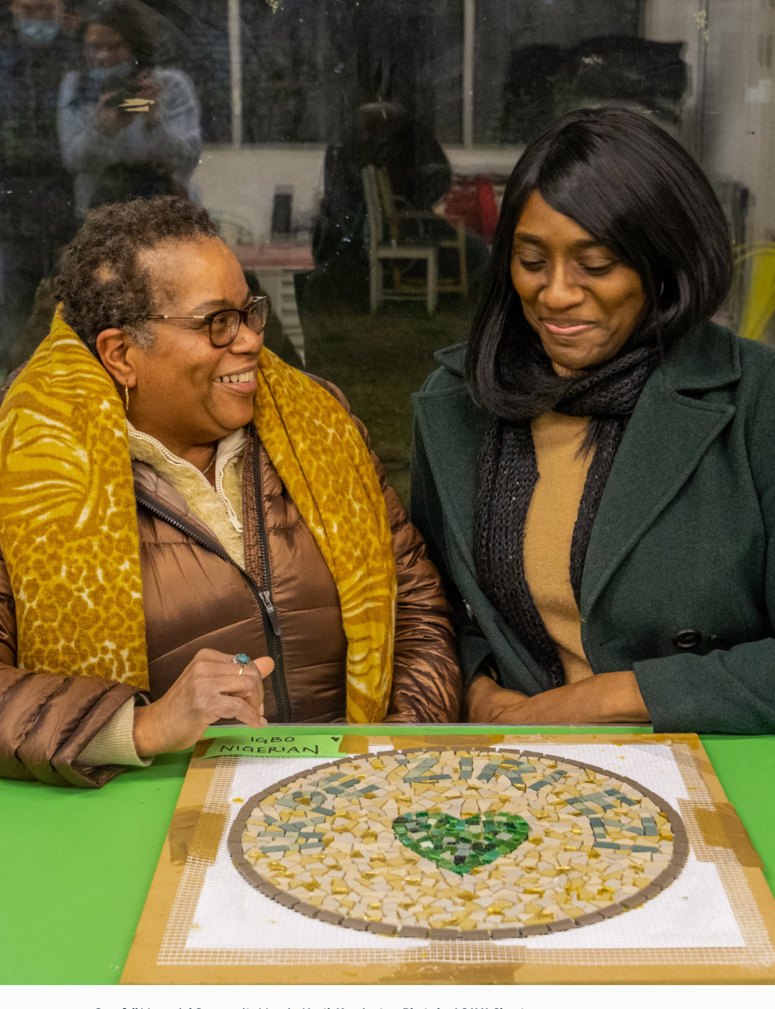
Grenfell Memorial Community Mosaic, North Kensington.