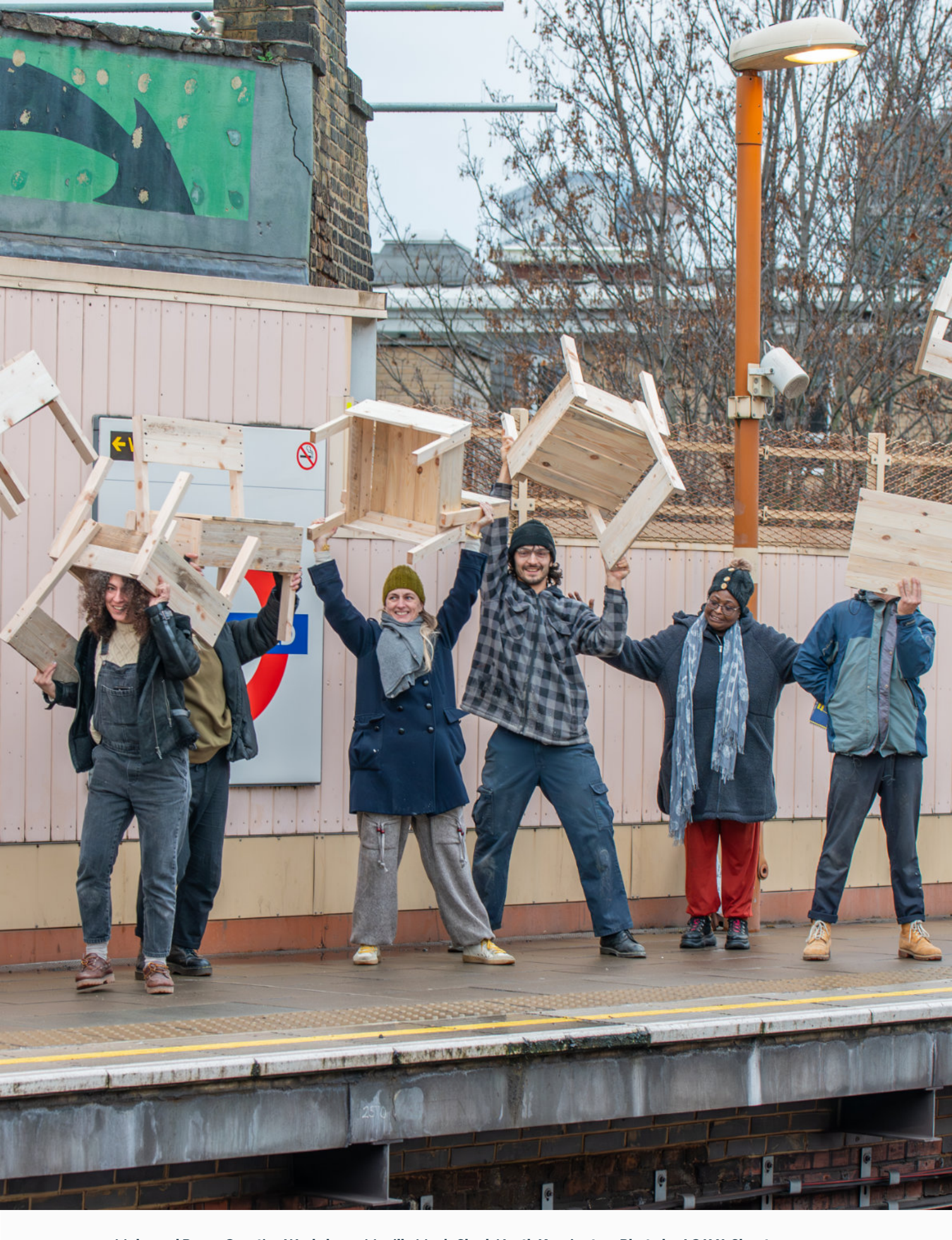
Make and Reuse Creative Workshops, Maxilla Men's Shed, North Kensington.