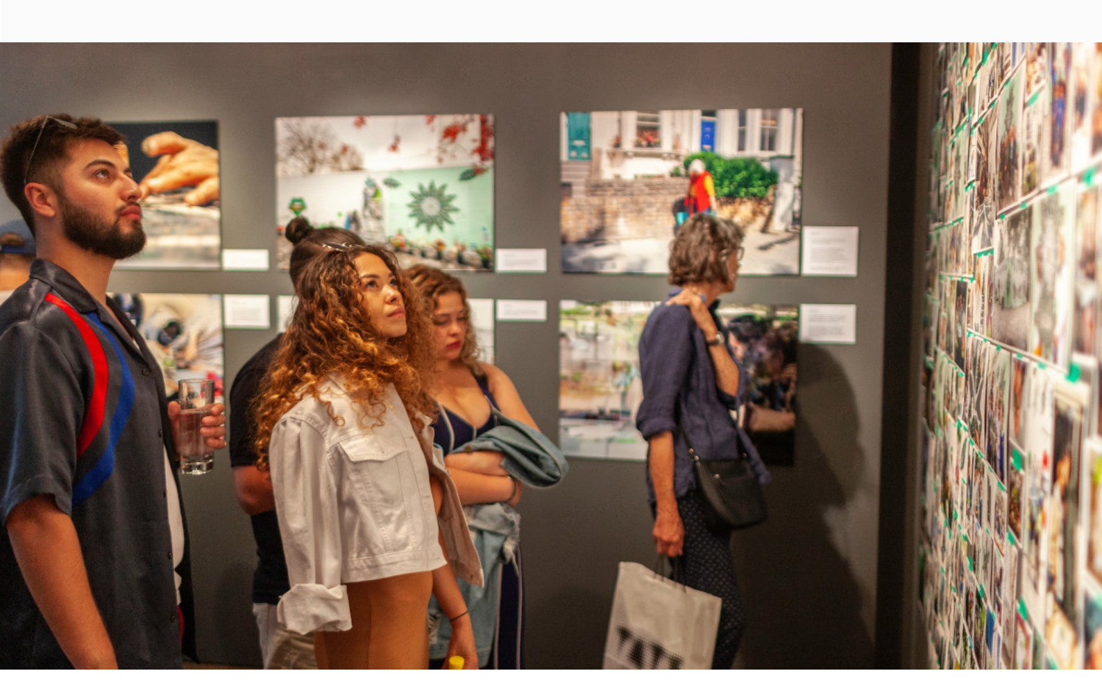
Piece Together: Documenting Grenfell Memorial Community Mosaic, The Photographers' Gallery

ACAVA is at the heart of a vibrant, place-based creative network, cultivating diverse talent, impactful programmes and strategic partnerships that connect communities with a broad network of stakeholders. By initiating collaborations across the arts, public, and private sectors, ACAVA fosters partnerships that amplify our impact and drive sustainable social change.