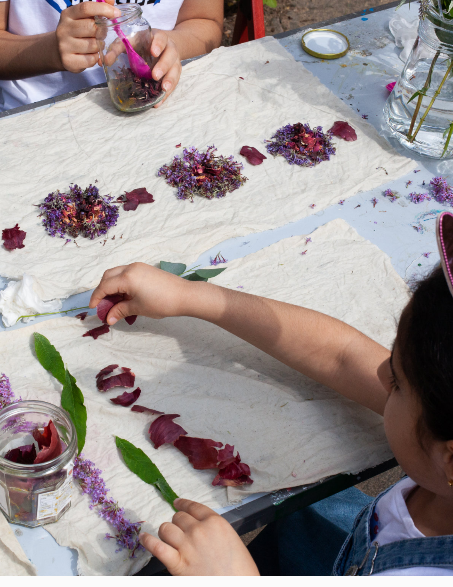
Flourish, North Kensington.