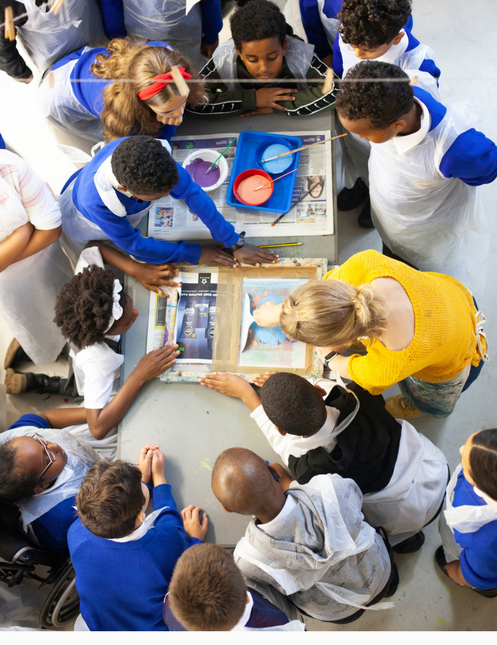
Young London Print Prize.