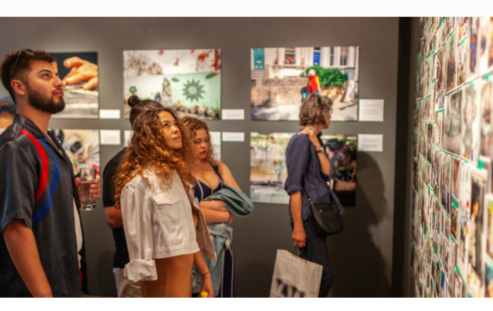
Piece Together: Documenting Grenfell Memorial Community Mosaic, The Photographers' Gallery

ACAVA is at the heart of a vibrant, place-based creative network, cultivating diverse talent, impactful programmes and strategic partnerships that connect communities with a broad network of stakeholders. By initiating collaborations across the arts, public, and private sectors, ACAVA fosters partnerships that amplify our impact and drive sustainable social change.